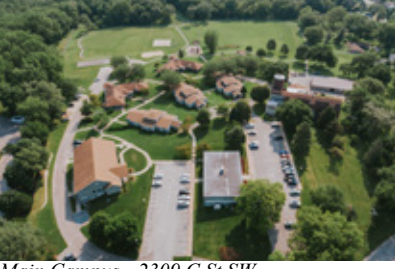
Main Campus - 2309 C St SW