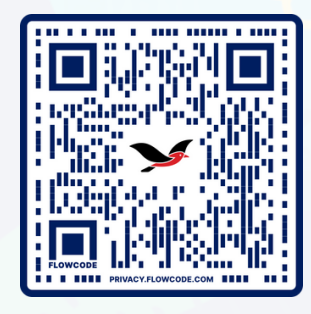
Scan to learn more and to enroll your child